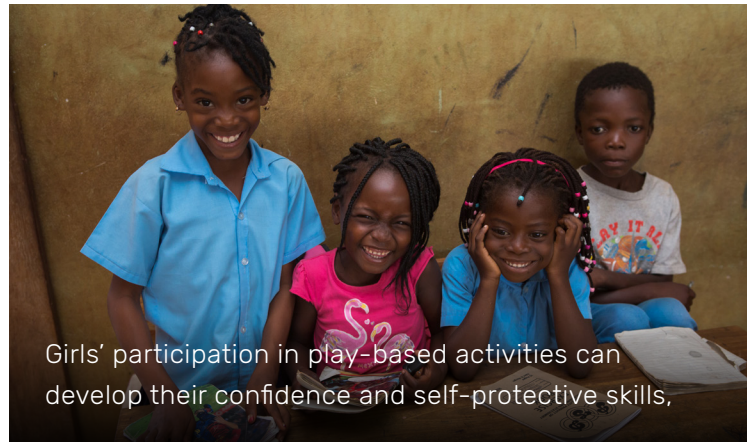
Girls' participation in play-based activities can develop their confidence and self-protective skills.